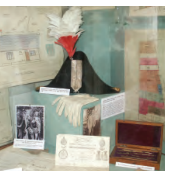
Part of the Reside collection at Newry Museum. Actors who took part in an historical re-enactment at Louth County Archives Service.

Within this project Newry and Mourne Museum (based in Newry) and Louth County Archive Service (based in Dundalk) made accessible via ICT, archival information on the historical development of the Newry and Mourne/Louth cross border region.