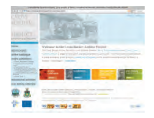
Website of the Cross Border Archive Project.